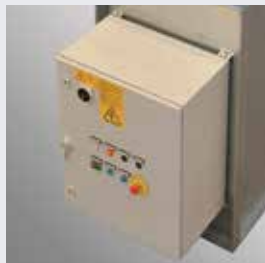
UL Labeled Control Panel / Starter