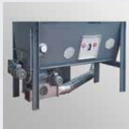
upgraded system with hopper, and screw conveyor, and rotary air lock for automatic discharge to trailers