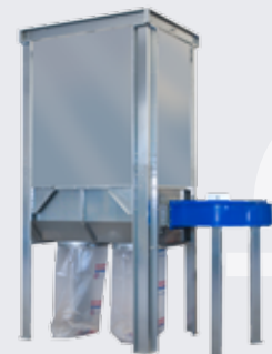
Optional panels for enclosed version - Outdoor unit