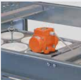
Automatic motorized shaker